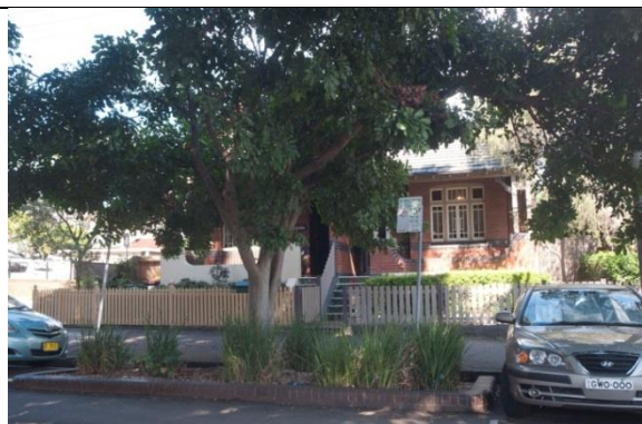
2-4 Warburton Street, Marrickville

No. 2- [Lot 4 DP711396], No. 4 – [Lot 3 DP711396], No. 6 –[ Lot 2 DP711396], No. 8 –[ Lot 1 DP711396], No. 10 – [Lot 2, DP220068], No. 12 –[ Lot 1, DP220068]