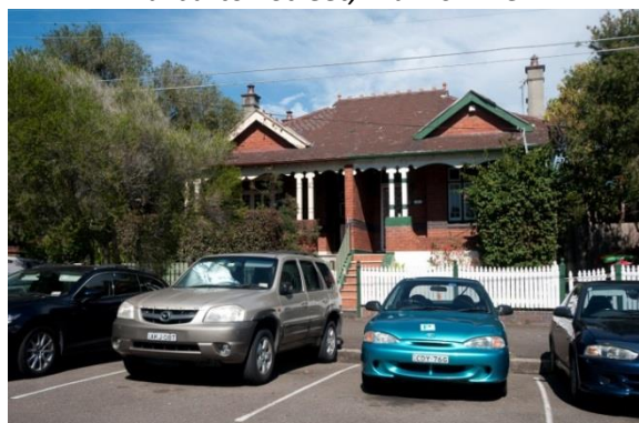
6-8 Warburton Street, Marrickville