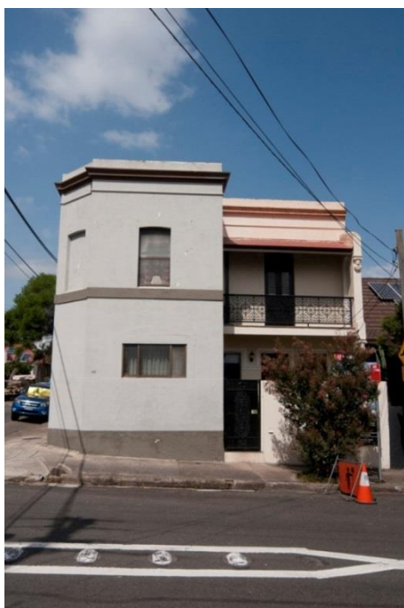
No. 50 Frederick Street, St Peters