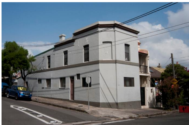
48 Frederick Street, St Peters

No. 50 - [Lot A, DP403148], No. 48 - [Lot B, DP403148]