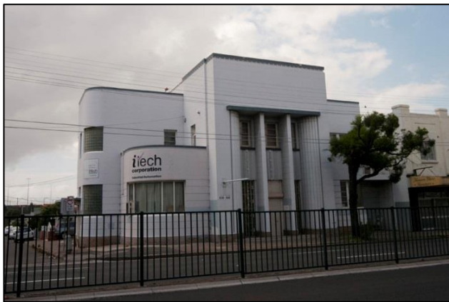
Image of Site