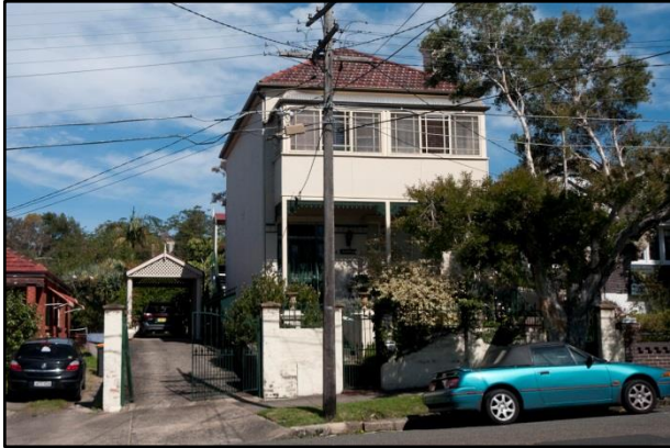
Image of Site