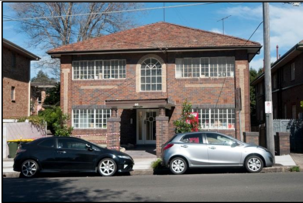
No. 66 "Rothesay"

[Lot C, DP329277] on [SP51780] and [SP49920]