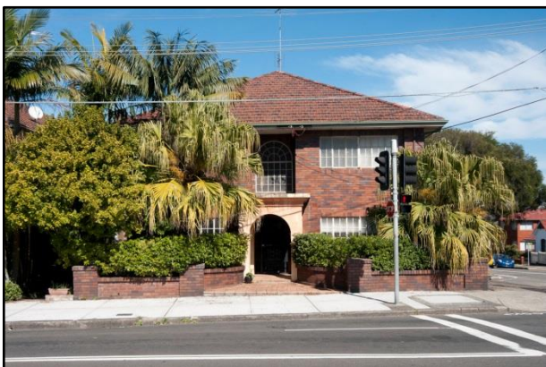
No. 70 "Warwick"