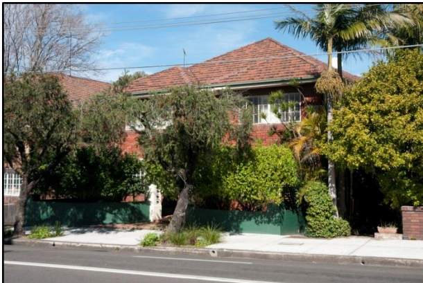
No. 68 "Windsor"