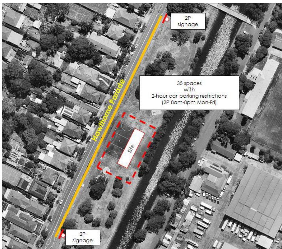
Image 1.0 Proposed Parking Restrictions Richard Murden Reserve.