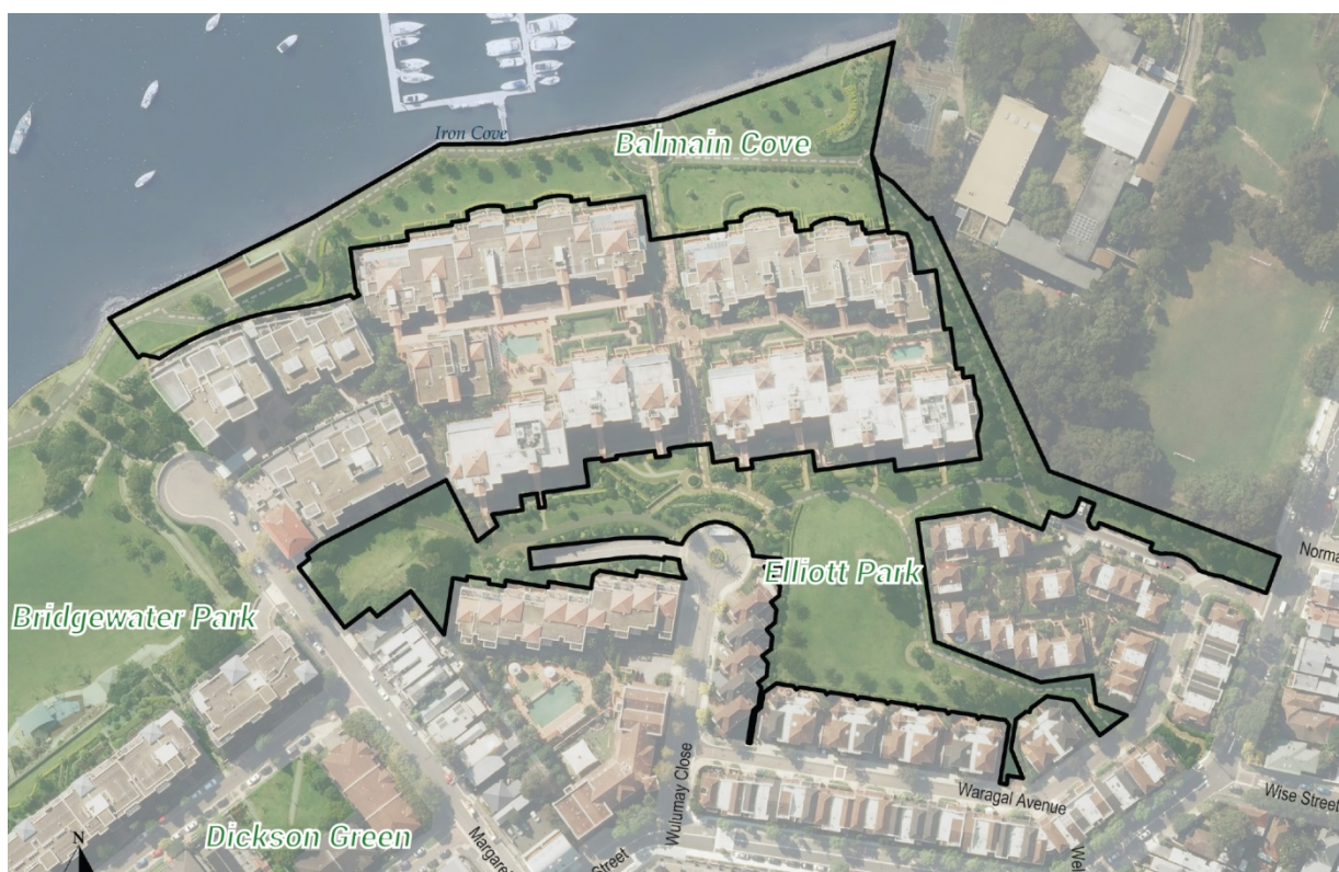
Fig 1.0 Site Location Balmain Cove and Elliot Park