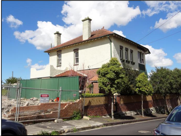
Image of Site

[Lot 14, DP60038] & [Lot 15, DP60038] & [Lot 16, DP60038]