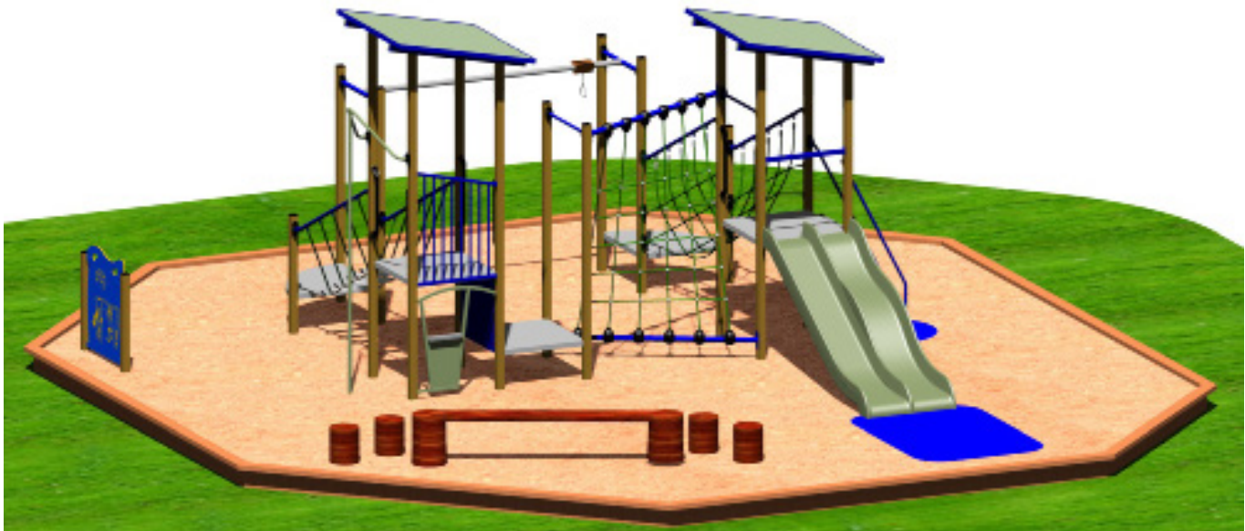
Slides, bridge, swinging Steps, climbing rope, towers, decks, fireman pole, shopfront