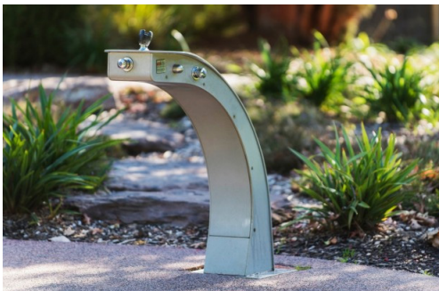
Timber balance beams, sandstone rocks, mulch softfall, bubbler