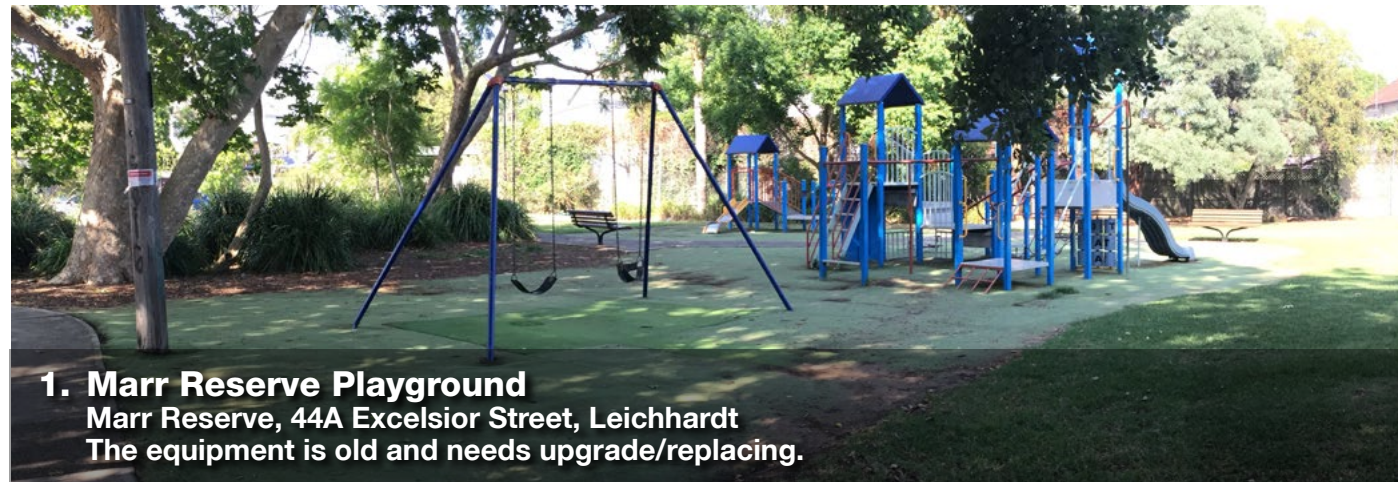
1. Marr Reserve Playground Marr Reserve, 44A Excelsior Street, Leichhardt The equipment is old and needs upgrade/replacing.