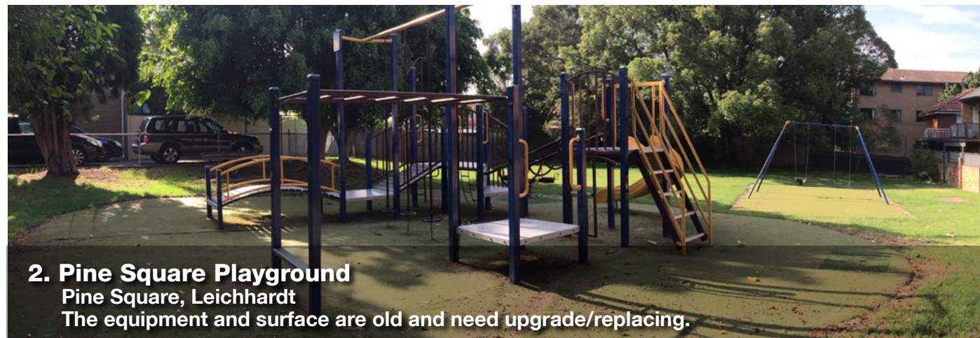
2. Pine Square Playground Pine Square, Leichhardt The equipment and surface are old and need upgrade/replacing.