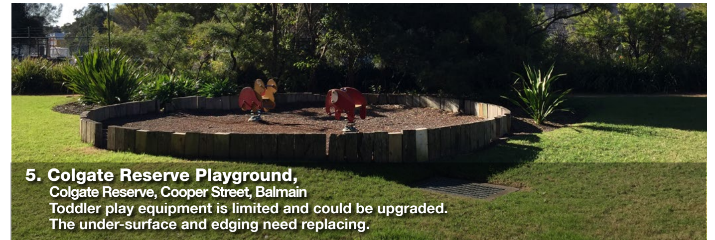
5. Colgate Reserve Playground, Colgate Reserve, Cooper Street, Balmain Toddler play equipment is limited and could be upgraded. The under-surface and edging need replacing.