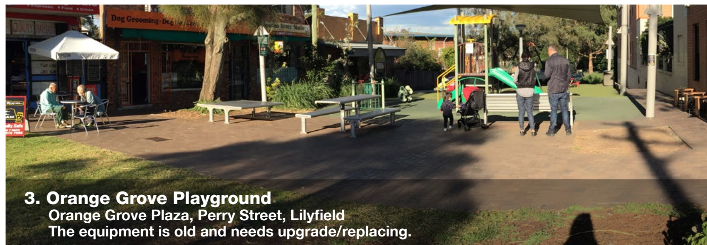
3. Orange Grove Playground Orange Grove Plaza, Perry Street, Lilyfield The equipment is old and needs upgrade/replacing.