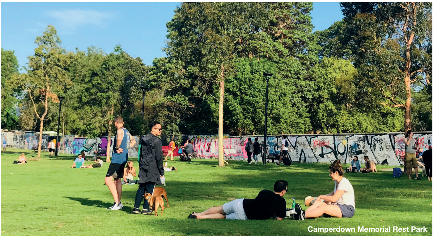
Camperdown Memorial Rest Park

Inner West Council is working to ensure these valued public assets are safe and welcoming for all.