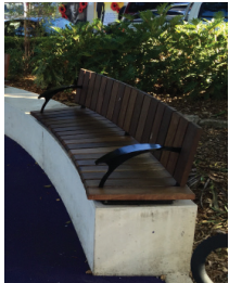
Wall Mounted Seat - by Street Furniture Australia