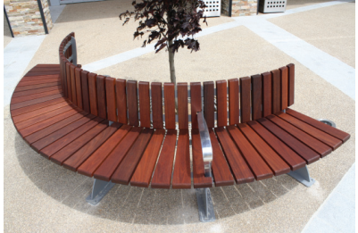
Curved seat w backrest and arm rest - by Street Furniture Australia