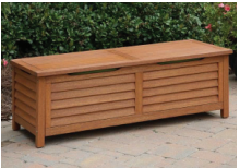
Storage Bench - Luxo Eucalytus Timber www.deluxeproducts.com.au