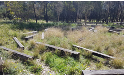
1. Nature play