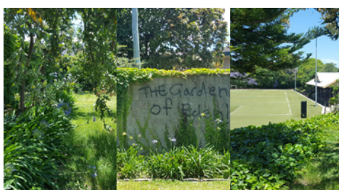
1. The Garden of Eden (existing situation)