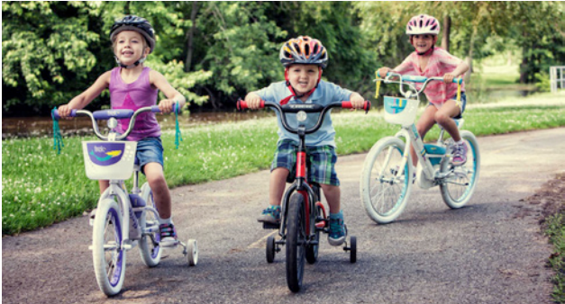
2. Circuit track around playground