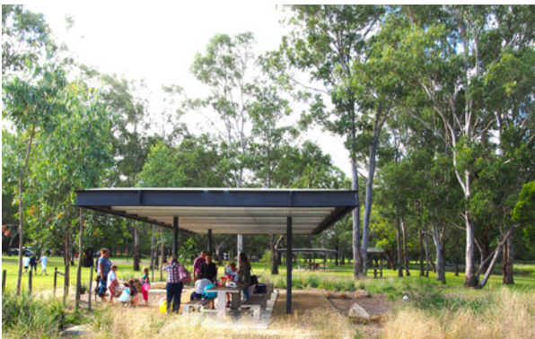
4. Picnic & BBQ shelters beneath shade trees