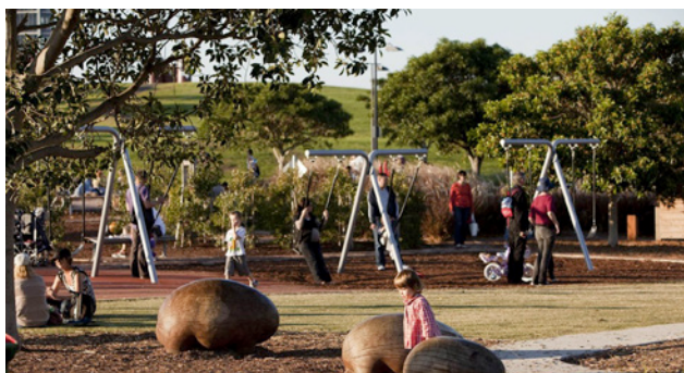
3. Playground (natural atmosphere; shade, mulch softfall, nature play elements)