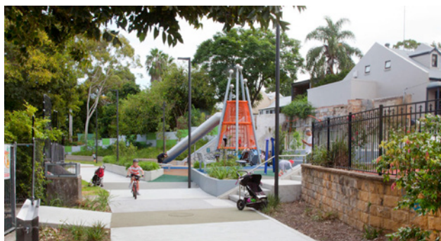
4. Elevated playground / grade separation shared path & playground