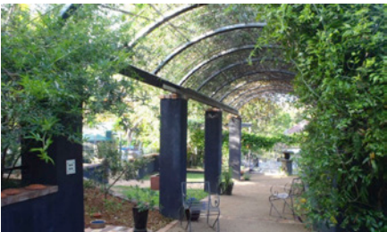
2. Climbers on existing shade structure