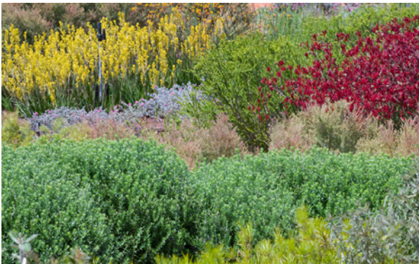
3. Flowering border planting