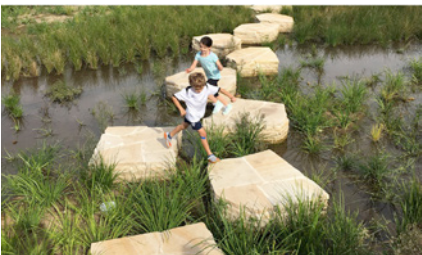
3. Stepping stones