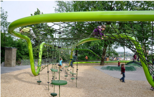
2. Upgraded playground