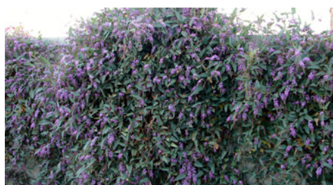
2. Native climbers on wall