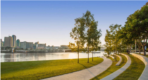
1. Grass terraced seating with trees