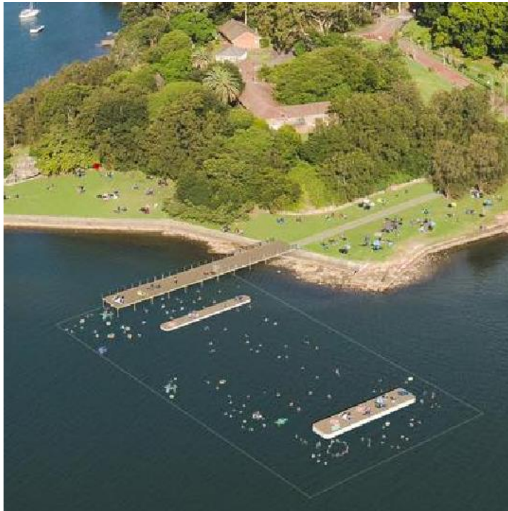
Figure 1: Photo montage – Callan Park Preliminary Swim Site Design