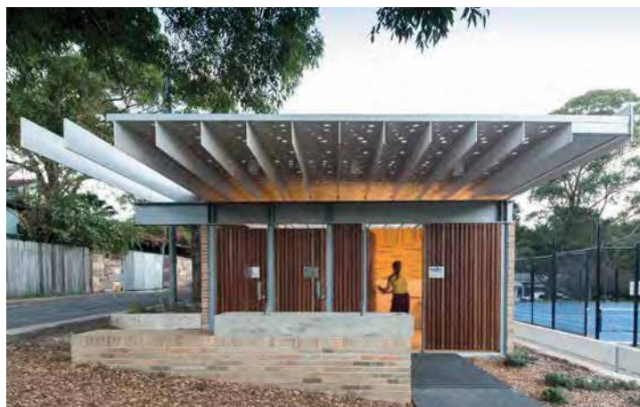
Cohen Park Amenities on Gadigal Land, Annandale Sydney Welsh + Major Architects

10 Accessible canoe/ kayak launching ramp to Cooks River