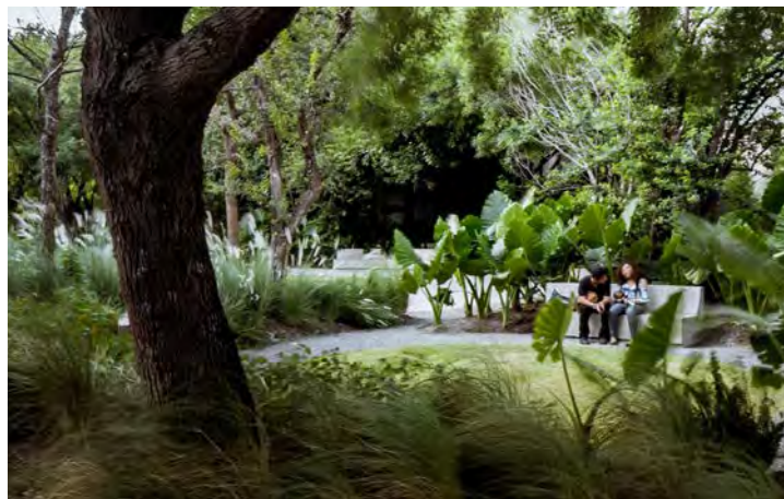
Citizen Garden, Monterrey Mexico Práctica Arquitectura

09 Existing water tanks and service shed retained in place