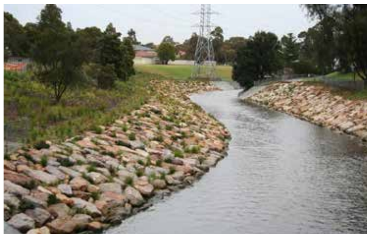
Naturalisation project, a site further upstream on Cooks River, Sydney Sydney Water