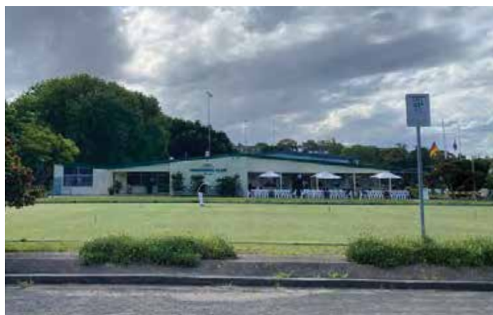
Concordia Club restaurant with croquet lawns in foreground, Mackey Park, Marrickville Photo by Welsh + Major