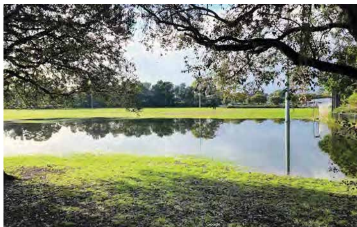
Flooding extending past stormwater garden, Mackey Park, Marrickville