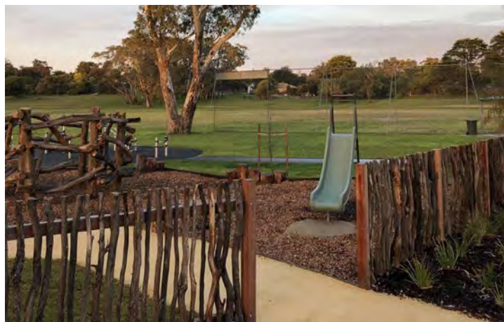
Nature play park with timber branch fence at Naracoorte Memorial Oval, SA Nature Play Landscaping