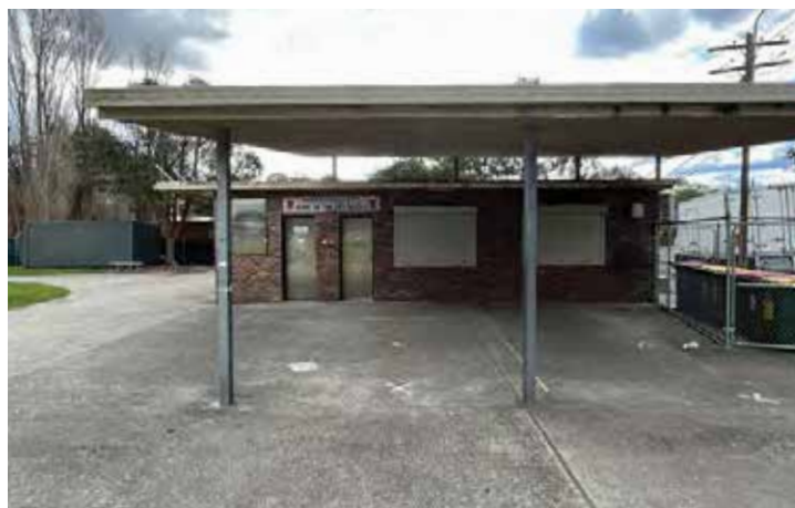
Brick amenities block with kiosk and awning, Mackey Park, Marrickville Photo by Welsh + Major