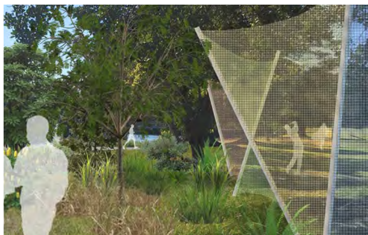
A playful and gentler alternative to a typical ball fence Welsh + Major