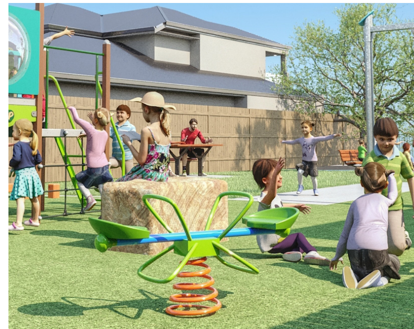
Existing Rocker (Recoated)