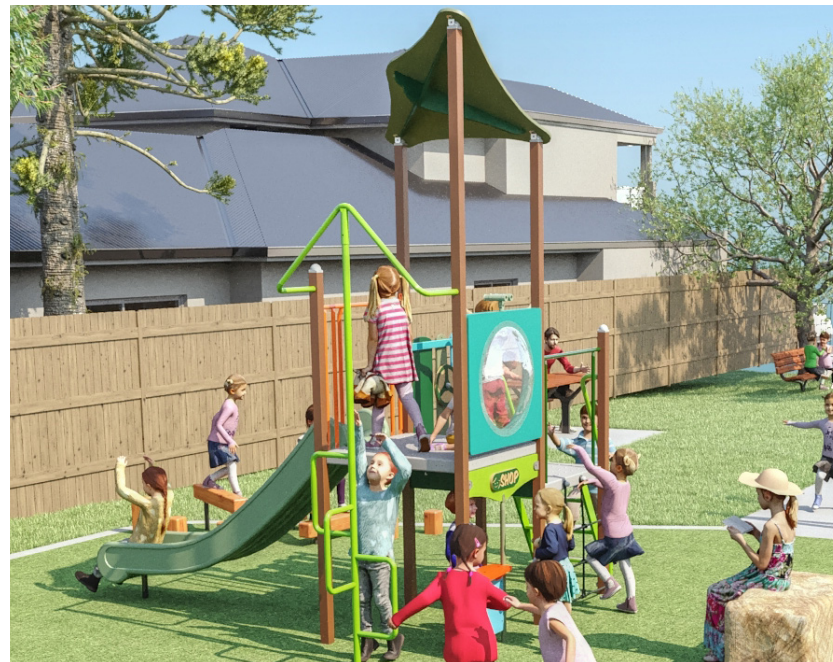
Capital Multiplay Unit