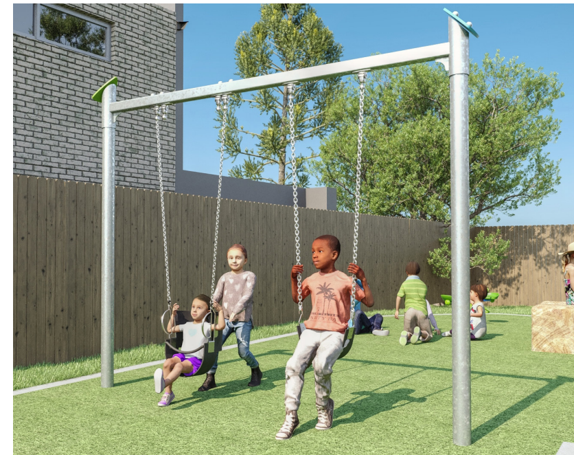
Capital Compact Swing