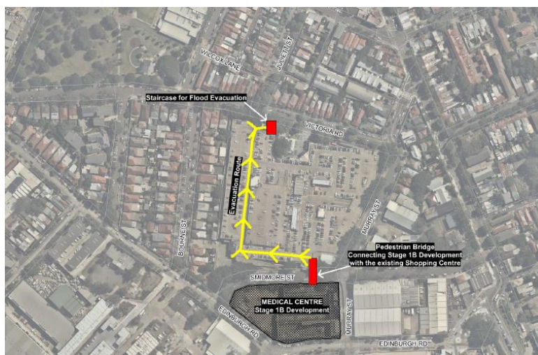
Figure 3: Evacuation Route identified for Stage 1B Development

The FAERs have identified an evacuation route and a safe off-site evacuation point is available during a flood event to facilitate any emergency evacuations for users of the medical centre and childcare centre (refer to Figure 3 ). The evacuation point is located via a staircase off Victoria Road to which access can be provided from an approved pedestrian bridge between the existing shopping centre and the new retail development on the site.