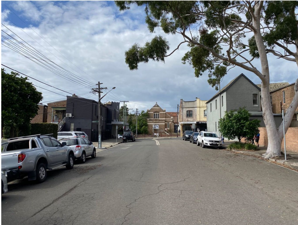
Figure 3: The Church of Christ terminates the view looking east along Greenbank Street