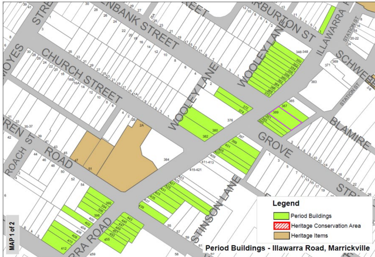
Figure 5: Period Buildings Map of MDCP 2011 with the subject site outlined in purple

The building is not listed as an item of environmental heritage in MLEP 2011, and it is not located within a heritage conservation area. It is, however, identified as a Period Building within the Marrickville Development Control Plan 2011 (MDCP 2011) (refer to Figure 5 below).