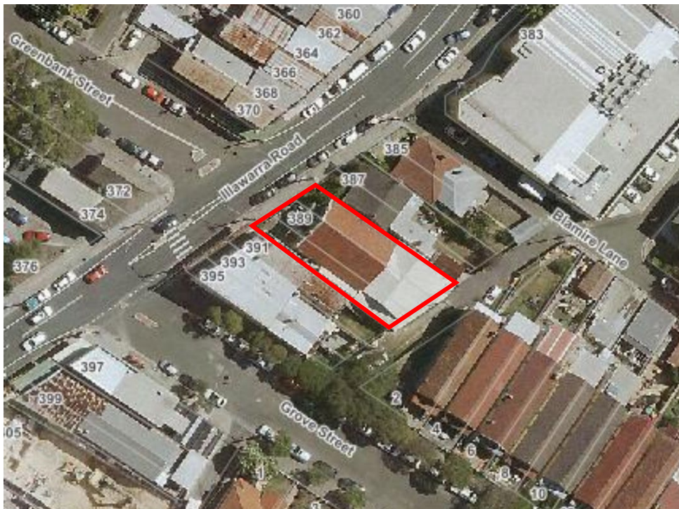
Figure 1: Aerial showing cadastre and location of 389 Illawarra Road, Marrickville (outlined in red)

Located on the site is a free-standing church building “in the Arts and Crafts style with gothic details, constructed of face common brick, with cement rendered bands and a chequerboard render pattern at the apex of the gable wall. The 1940 side entry porch is constructed of red brick. There is a parapet of face brick with rendered coping and a finial at the apex. The roof is covered by glazed terracotta Marseille tiles” (HAA, 2020 p.8).