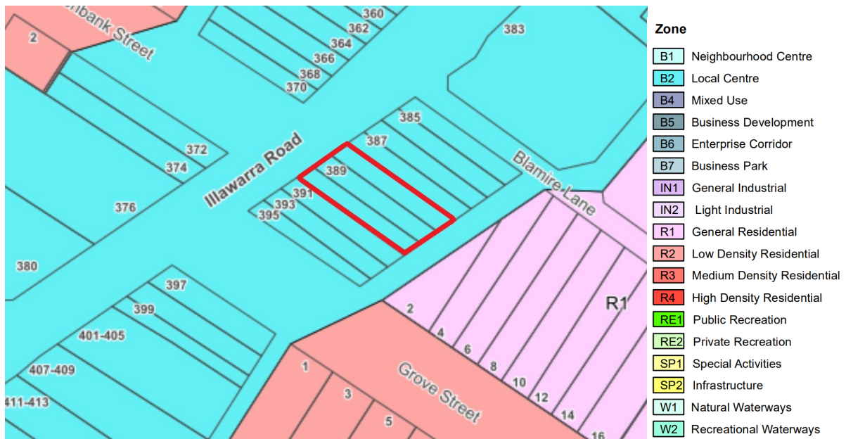
Figure 4: Extract of zoning map of MLEP 2011 (site within red boundary)

The site is zoned B2 Local Centre under MLEP 2011 and has a maximum permissible FSR of 2.5:1 and maximum building height of 20m.