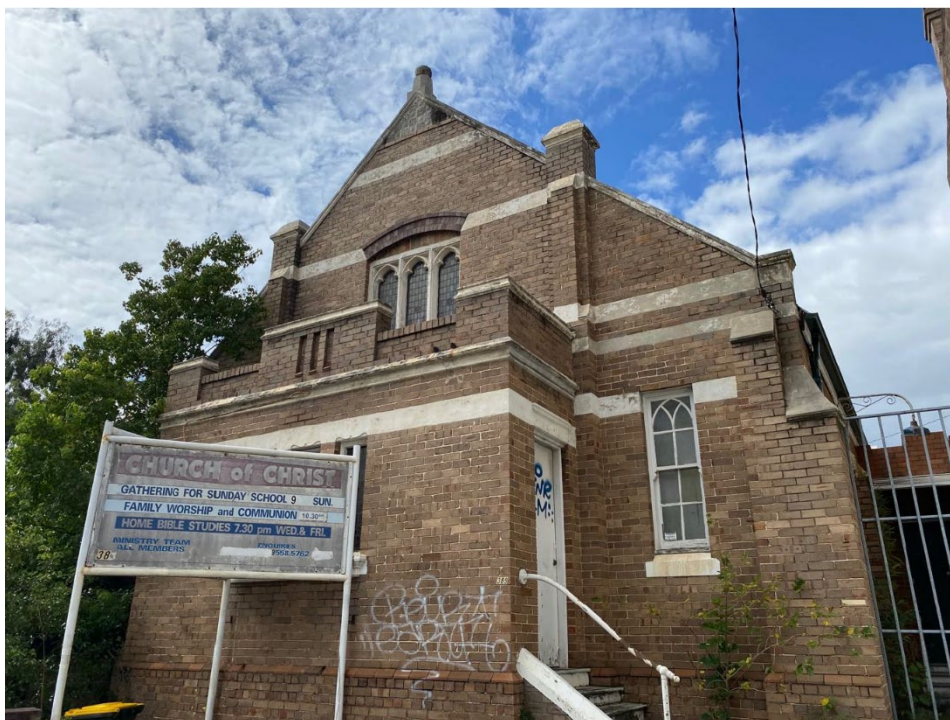
Figure 2: Church of Christ building viewed from Illawarra Road

Located on the site is a free-standing church building “in the Arts and Crafts style with gothic details, constructed of face common brick, with cement rendered bands and a chequerboard render pattern at the apex of the gable wall. The 1940 side entry porch is constructed of red brick. There is a parapet of face brick with rendered coping and a finial at the apex. The roof is covered by glazed terracotta Marseille tiles” (HAA, 2020 p.8).