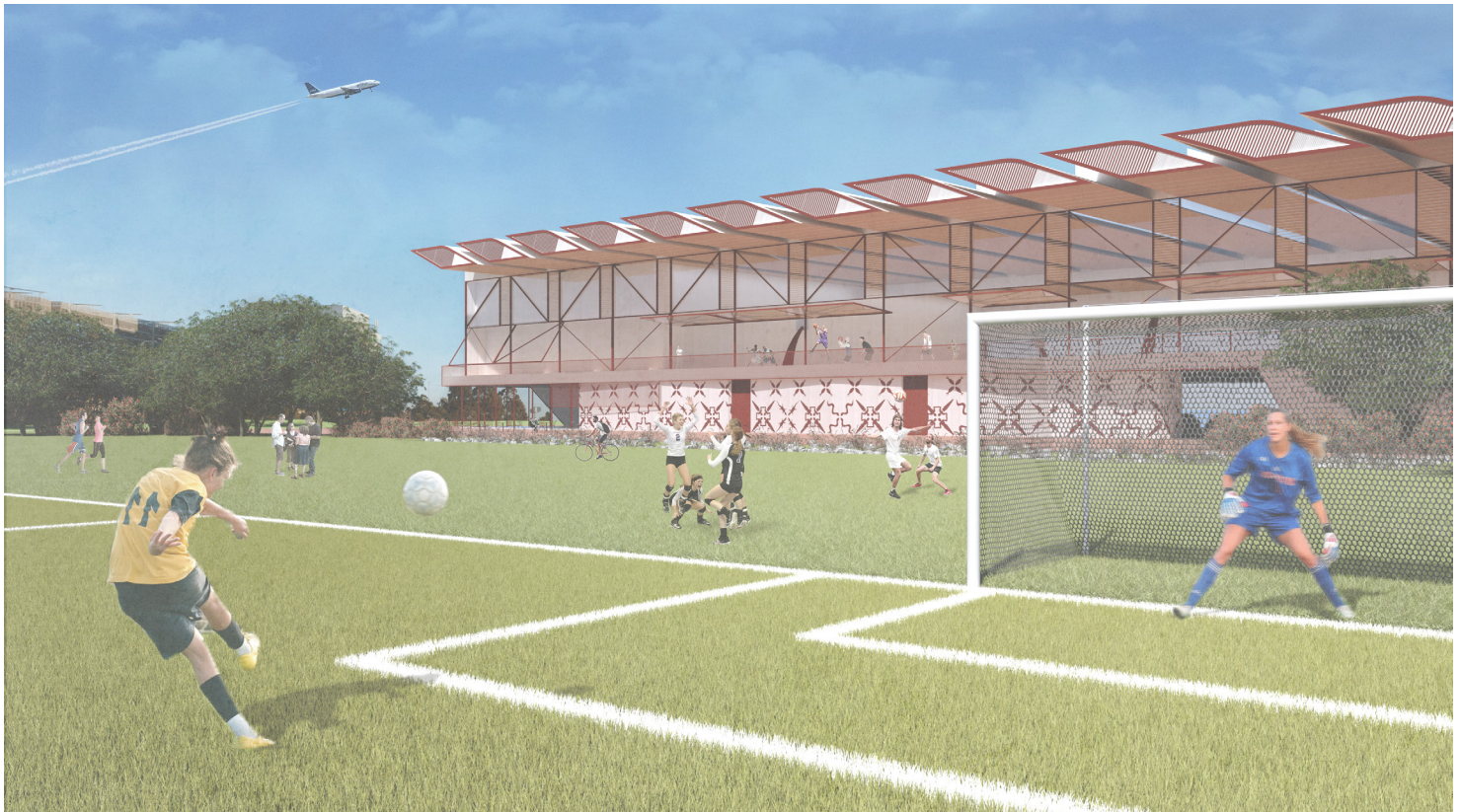
Artist's impression of view across sports fields towards new indoor sports, arts, cafe and amenities building.