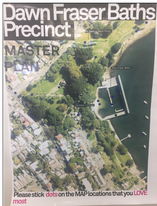
Figure 09: Respondents placed 'sticky dots' on plans highlighting respondents favourite locations within the Dawn Fraser Baths and Elkington Park.