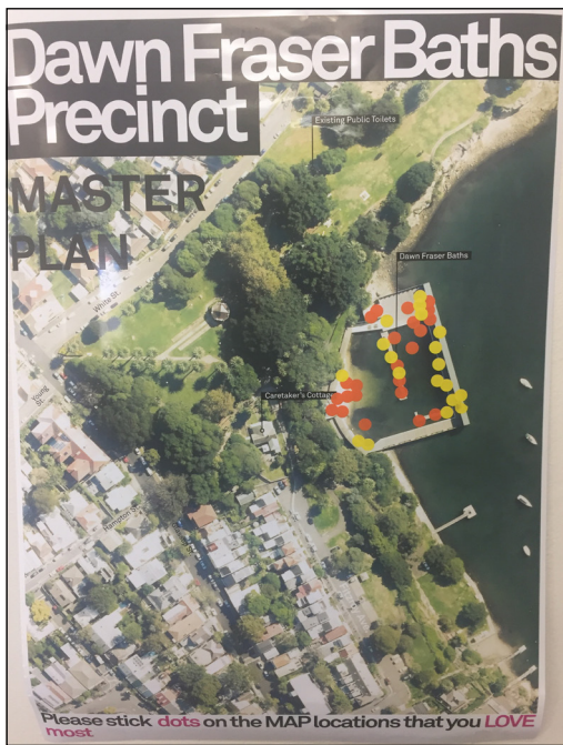
Figure 03: Respondents placed 'sticky dots' on plans highlighting respondents favourite locations within the Dawn Fraser Baths and Elkington Park.

Respondents were asked during engagement events to select their favourite and least favourite locations at the Dawn Fraser Baths and Elkington Park with 'sticky dots'. Respondents were asked to also outline in several words why they selected these locations.