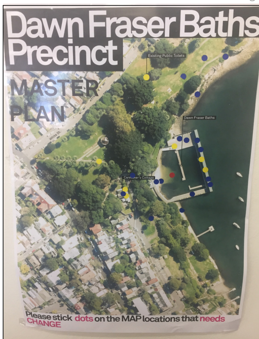
Figure 04: Sticky dots on plans highlighting respondents least favourite locations that need to change within the Dawn Fraser Baths and Elkington Park.