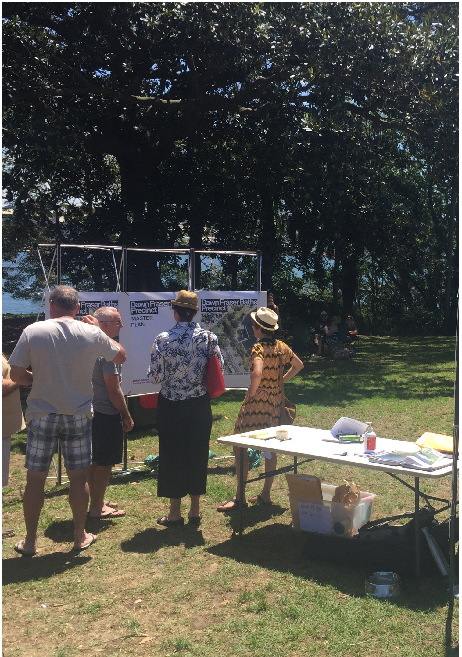
Community engagement event at the 'Back to Balmain Festival' in Elkginton Park on Sunday 29 October 2017.