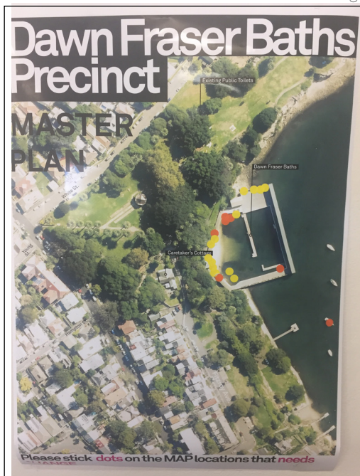
Figure 04: Respondents placed 'sticky dots' on plans highlighting respondents least favourite locations that need to change within the Dawn Fraser Baths and Elkington Park.