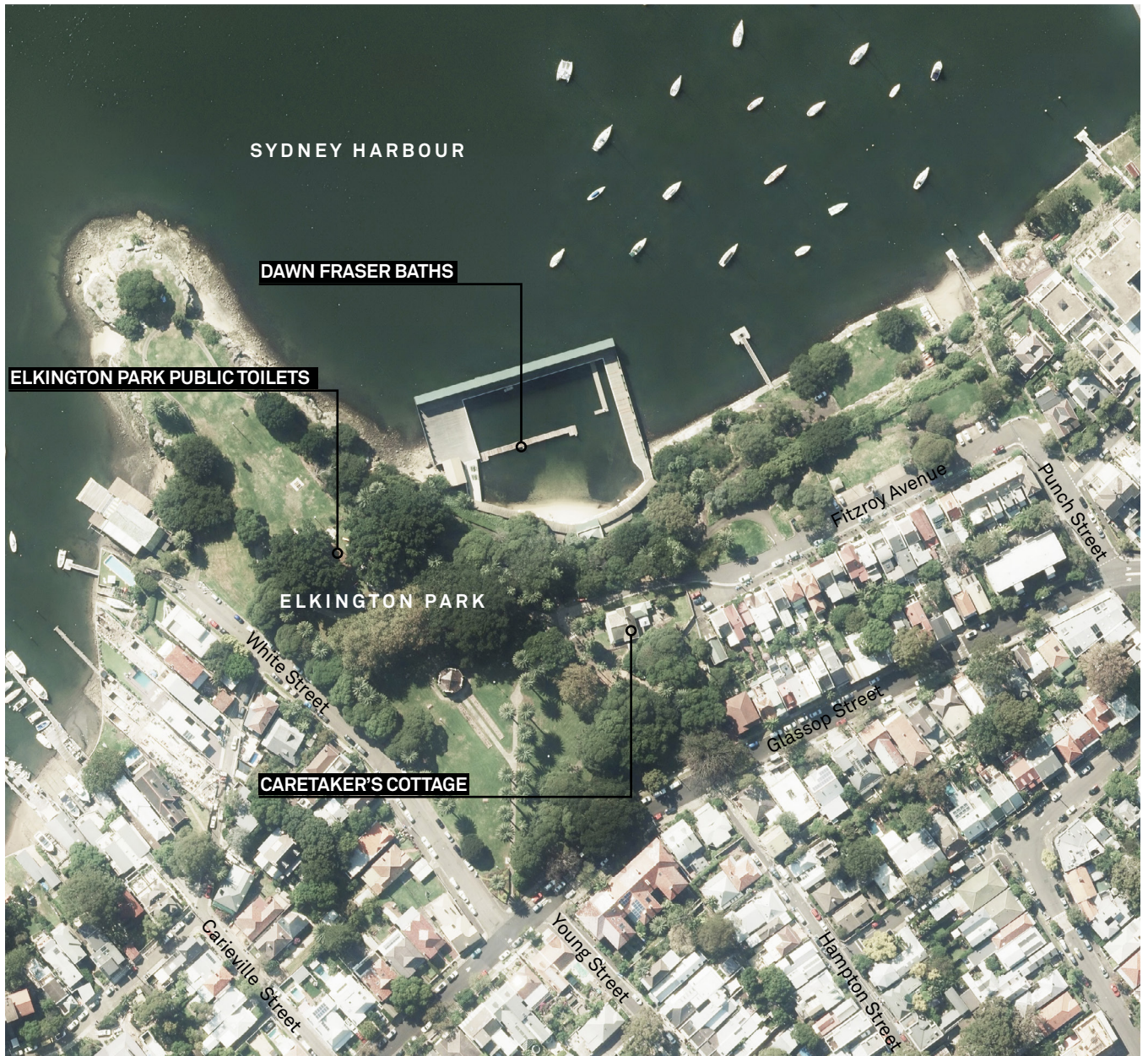
Figure 02: Project scope.