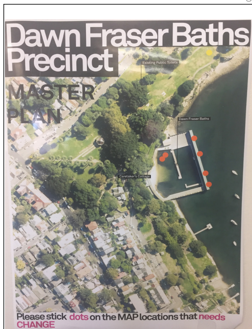
Figure 04: Respondents placed 'sticky dots' on plans highlighting respondents least favourite locations that need to change within the Dawn Fraser Baths and Elkington Park.