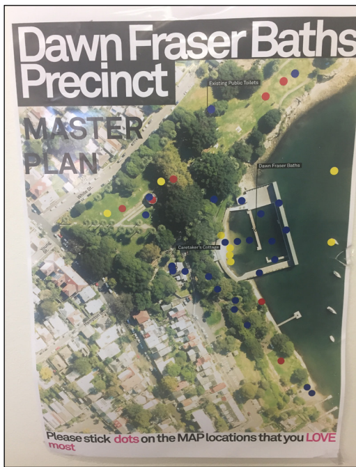
Figure 07: Respondents placed 'sticky dots' on plans highlighting respondents favourite locations within the Dawn Fraser Baths and Elkington Park.