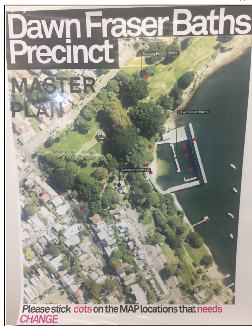
Figure 10: Respondents placed 'sticky dots' on plans highlighting respondents least favourite locations that need to change within the Dawn Fraser Baths and Elkington Park.