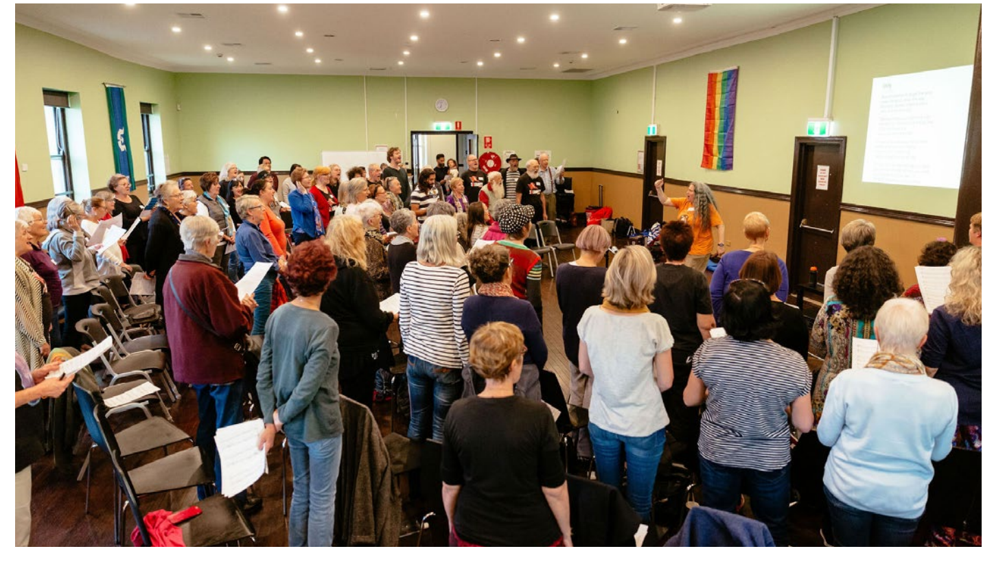
Pictured: Sing Welcome, the Solidarity Choir (2019)