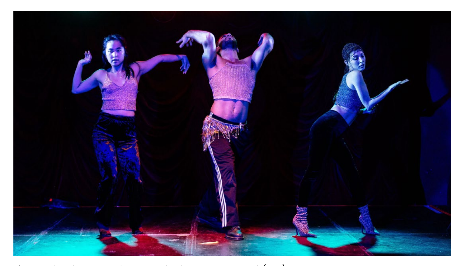
Pictured: Biryani and Babez, in partnership with the Brown Council (2019)