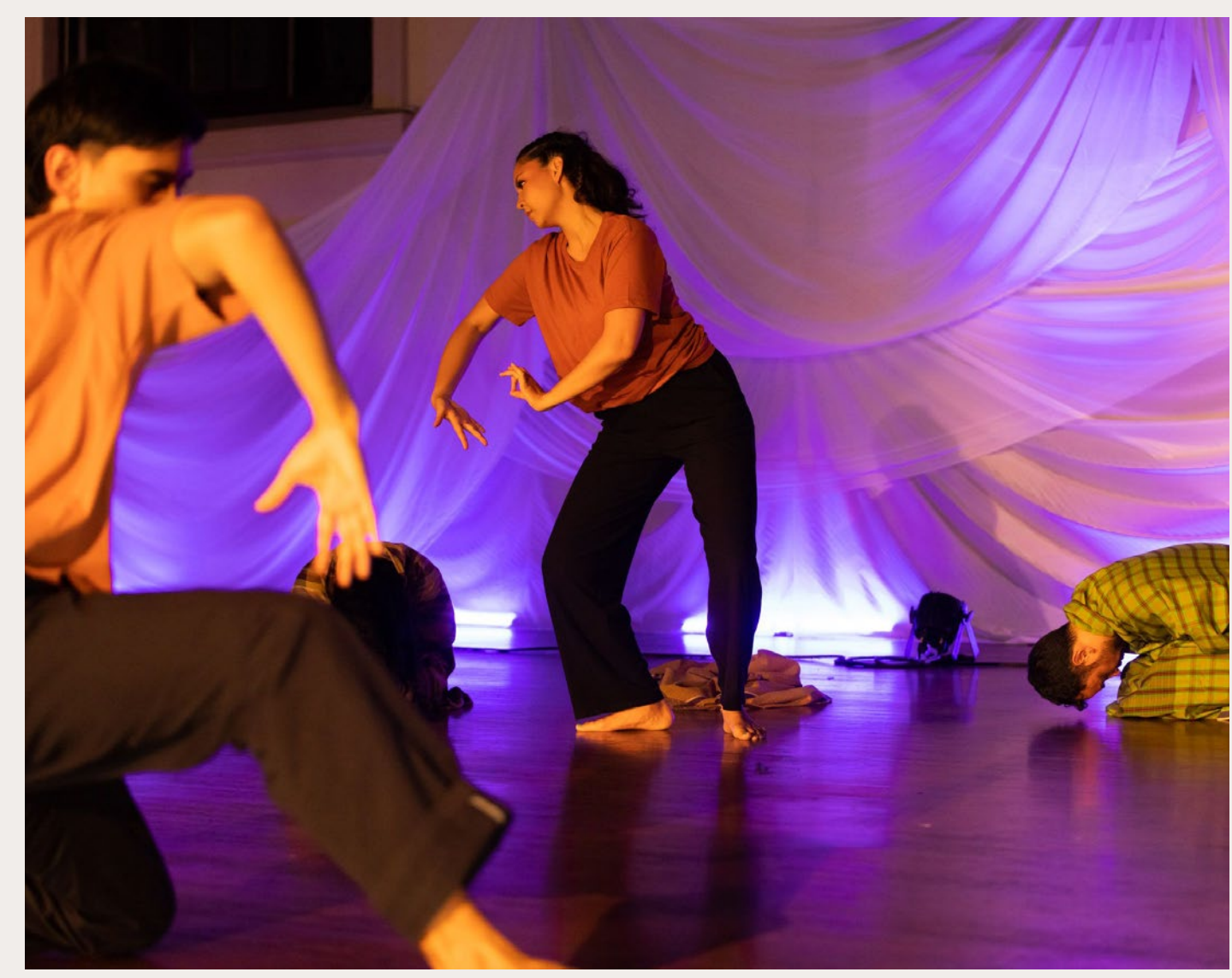
Pictured: Cicem, Suara Indonesia Dance, 2020 Arts grant funded project, presented by EDGE and Inner West Fest Marrickville 2022