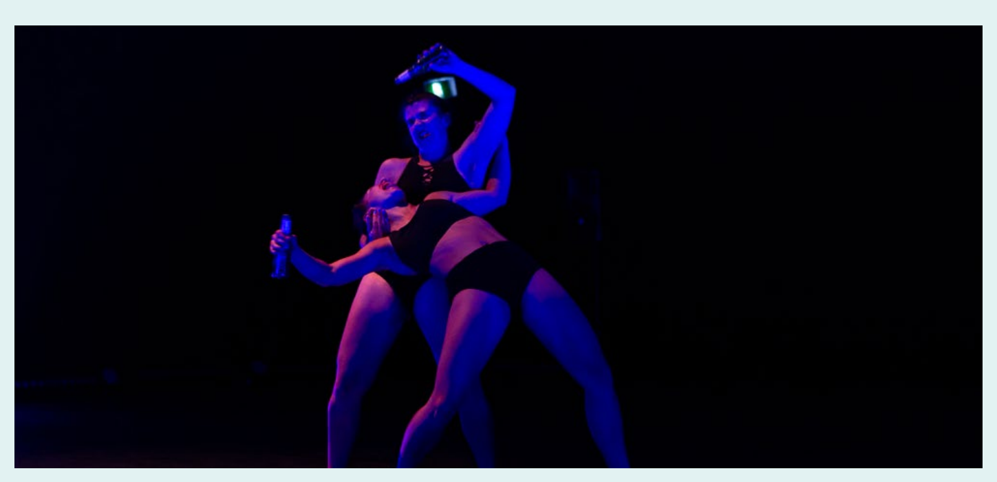
Pictured: Legs Hub, Legs on the Wall