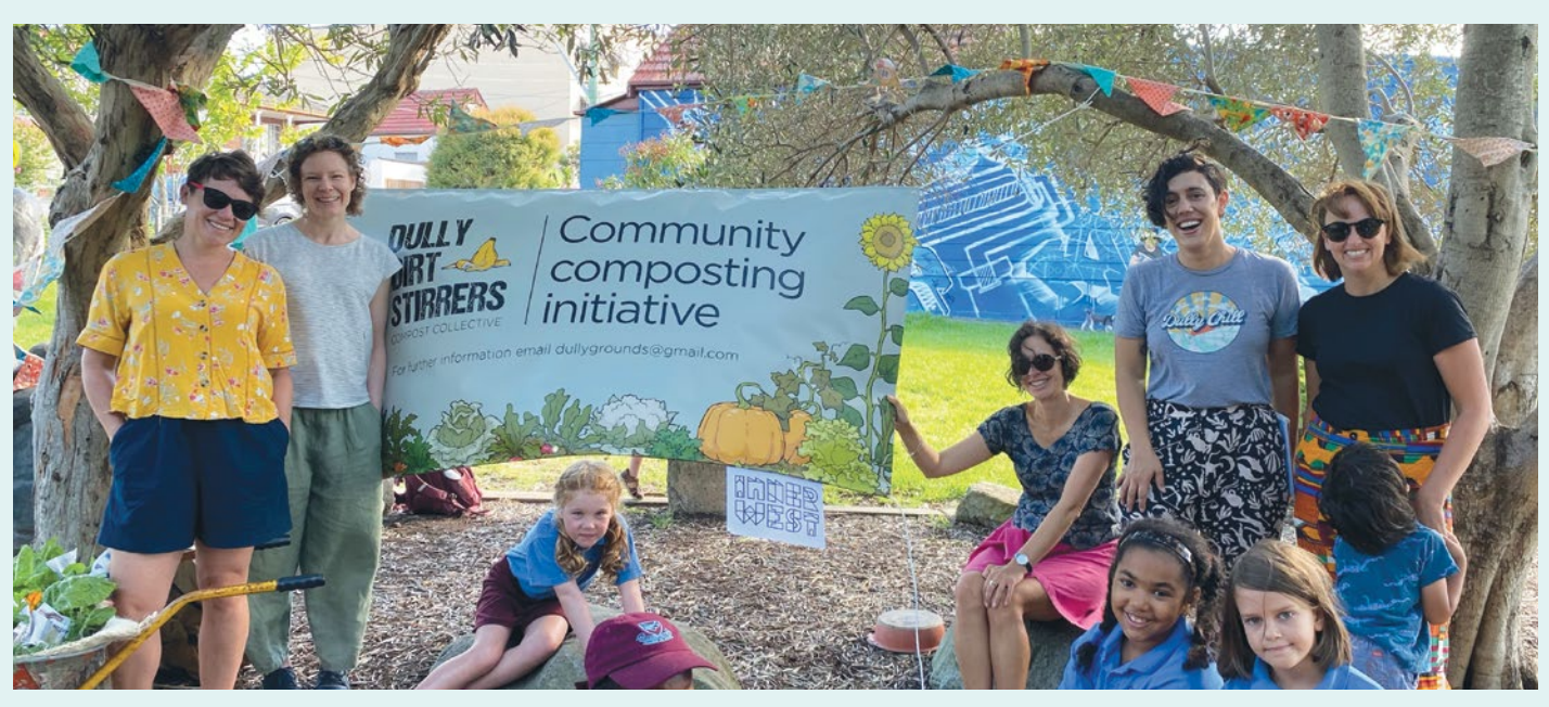
Pictured: Dully Dirt Stirrers community composting project, photo by Dulwich Hill Public P&C 2019

Environment grants of $10,000 each over two years ($5,000 per annum) are available.