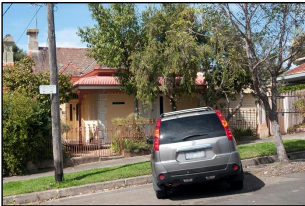
Image of Site