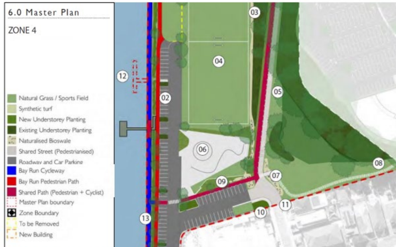
Figure 15: Excerpt from the Leichhardt Park Master Plan depicting the proposed Lilyfield Skate Plaza (06).