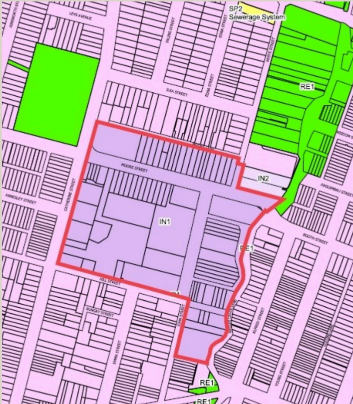
As exhibited – IN1 zoning

Moore Street Industrial Precinct to retain current IN2 - Light Industrial zoning