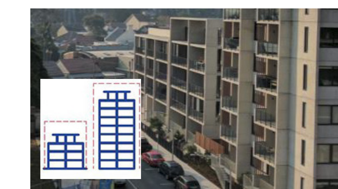
Residential flat buildings