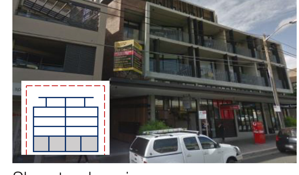
Shop top housing