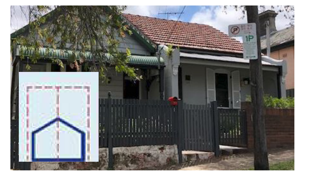
Two attached dwellings