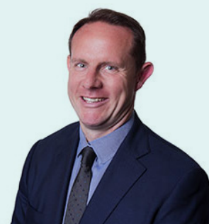
Darcy Byrne, Inner West Mayor