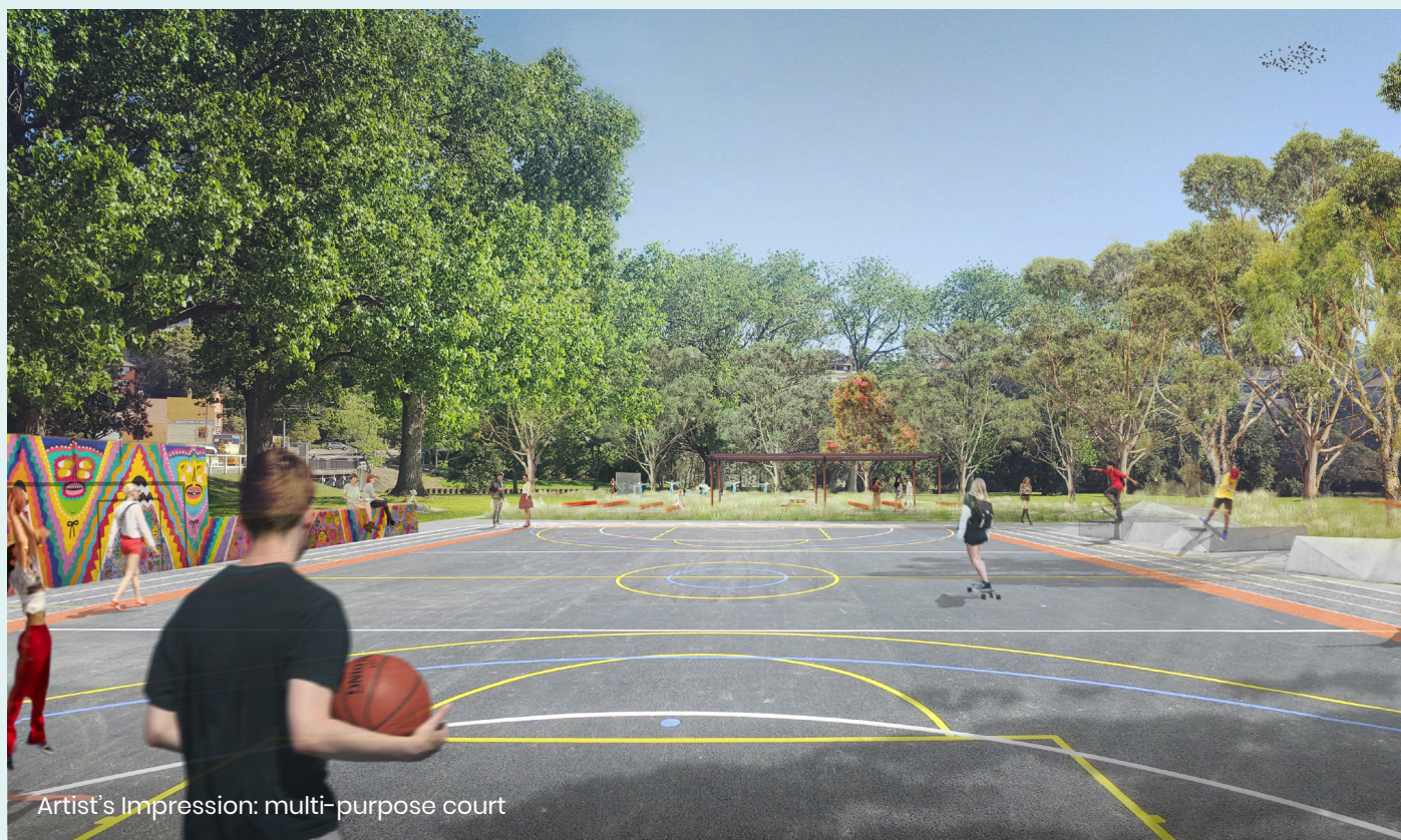
Artist's Impression: multi-purpose court

Too often the needs of young people are forgotten when public spaces are being designed.