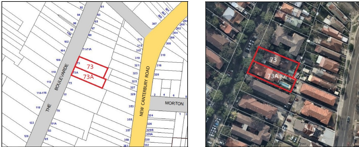
Fig. 1 & 2 – Cadastre and aerial location maps for 73 & 73A The Boulevard, Dulwich Hill