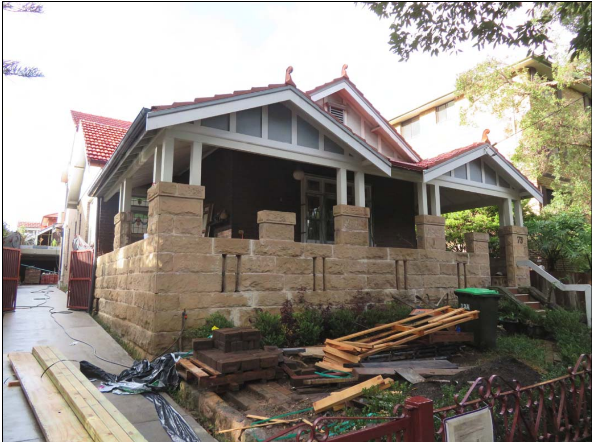
Fig. 4 – Photograph of 73A The Boulevarde, Dulwich Hill