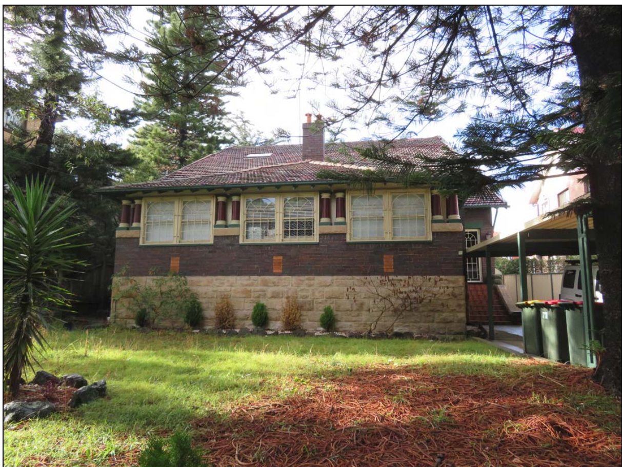
Fig. 3 – Photograph of 73 The Boulevard, Dulwich Hill