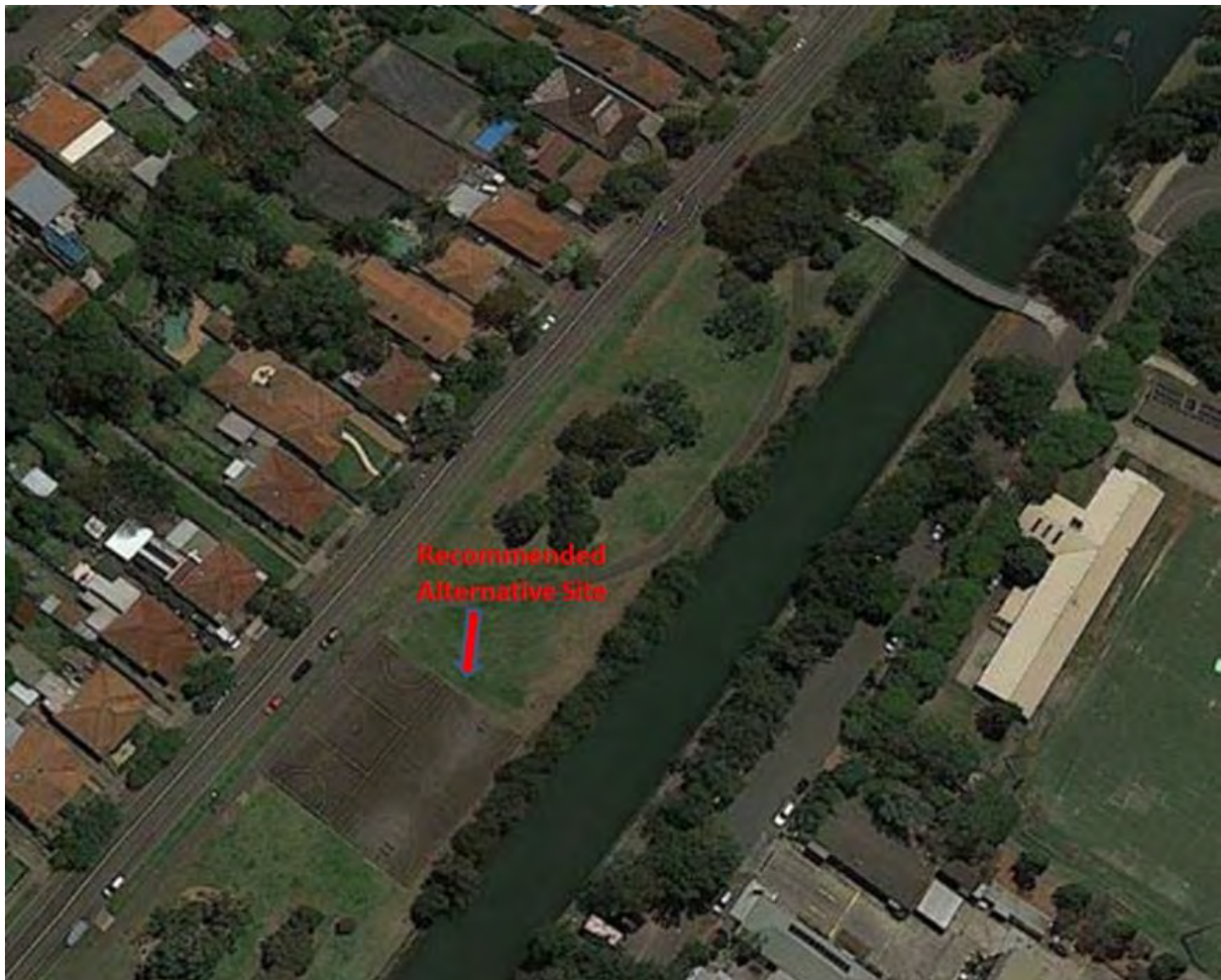
Fig 1.0 Aerial Photo of Existing Hard Surfaced Basketball Courts-Northern Zone of Richard Murden Reserve (Ashfield)

The alternative option has a number of positive factors. Two existing courts are already in place and there is good access across the northern Hawthorne Canal Road pedestrian bridge to Blackmore Park (Leichhardt).. In addition the Leichhardt Wanderers Netball Club have their club rooms located in walking distance to this site and current netball courts in Richard Murden Reserve are not meeting the needs of this growing club.