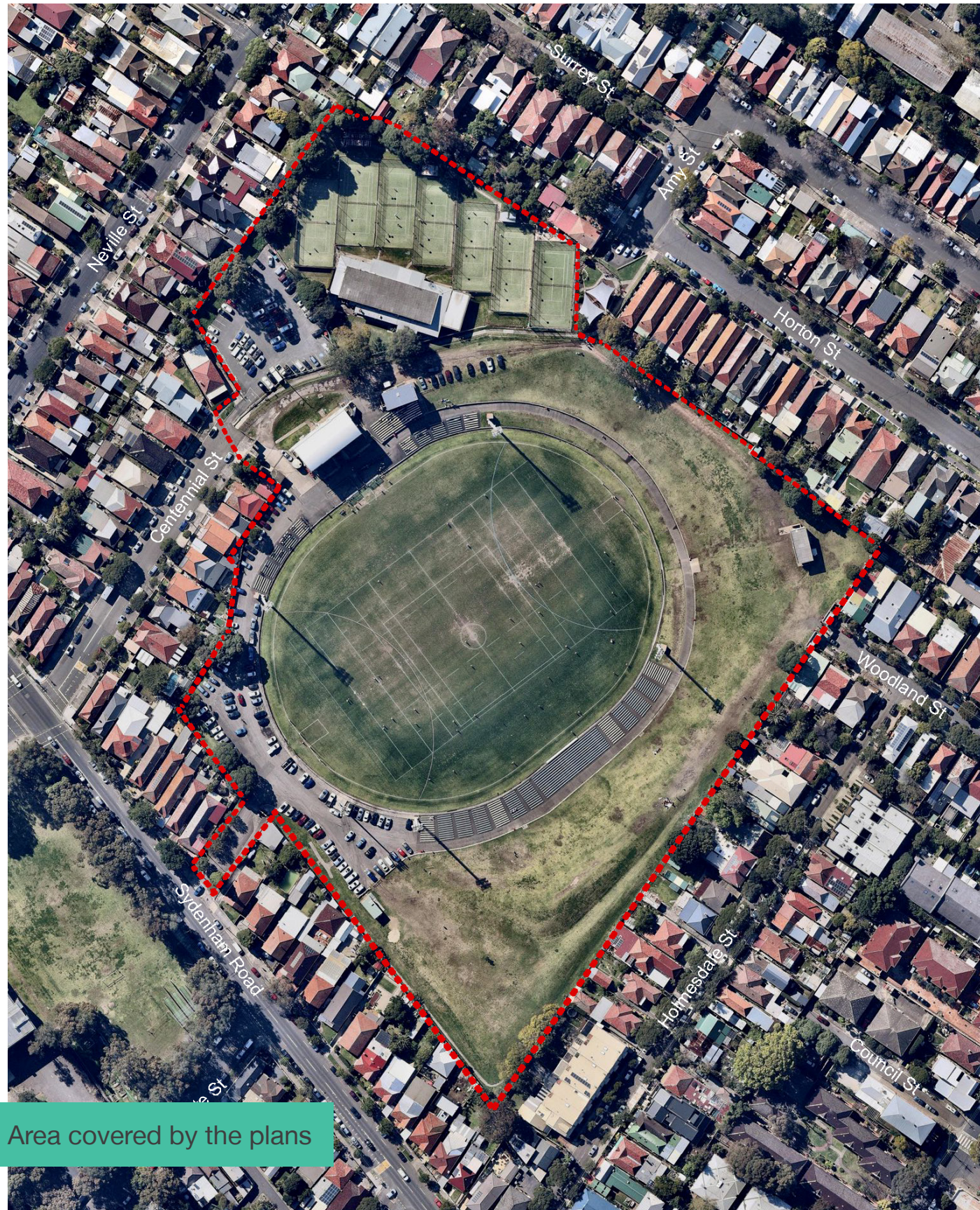
Area covered by the plans